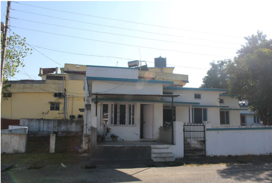
The Mindrolling Campus Medical Clinic

Samten Tse Charitable Society (STCS) aspires to enable expansion of the medical clinic, creating new rooms and facilities to provide proper, modern care and in-patient services.