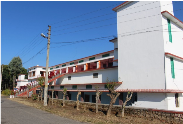
Existing monks' school, located above the Guru Lhakhang

This important expansion requires the addition of a third floor to the existing two-story school.